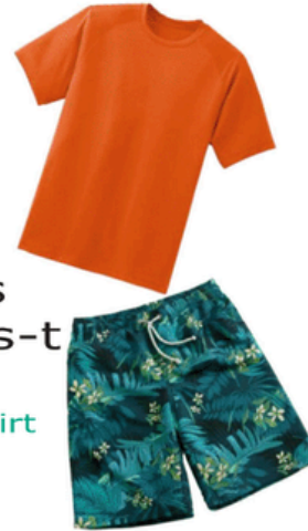
Siorts a Chrys-t Shorts and T-shirt